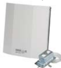
Sidewall Fan with Unattached Pressure Switch