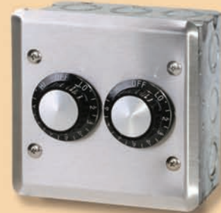
Part # 14-4105 (120V) - Part # 14-4205 (240V) Double SS Wall Plate w/Deep Gang Box (Includes Two (2) INF Input Regulators)