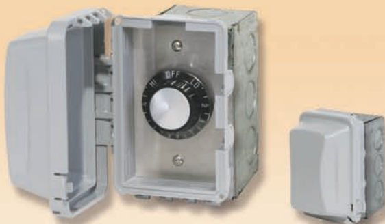
Part # 14-4110 (120V) - Part # 14-4210 (240V) Single Flush Mount w/Deep Gang Box (Includes INF Input Regulator)