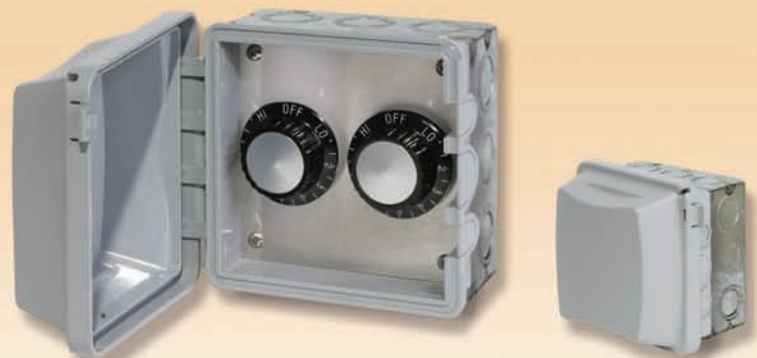
Part # 14-4115 (120V) - Part # 14-4215 (240V) Double Flush Mount w/Deep Gang Box (Includes Two (2) INF Input Regulators)