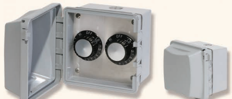
Part # 14-4125 (120V) - Part # 14-4225 (240V) Double Surface Mount w/Weatherproof Box (Includes Two (2) INF Input Regulators)