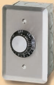
Part # 14-4100 (120V) - Part # 14-4200 (240V) Single SS Wall Plate w/Deep Gang Box (Includes INF Input Regulator)