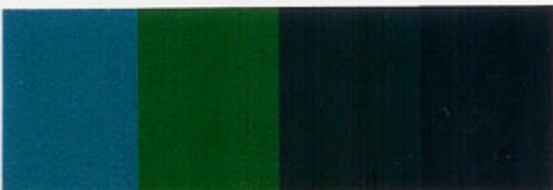
Teal Emerald Hunter Green Black