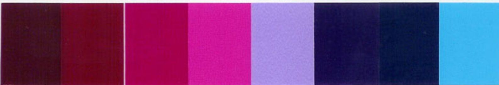
Burgundy Dubonnet Rosebloom Fuchsia Lavender Purple Royal Light Blue