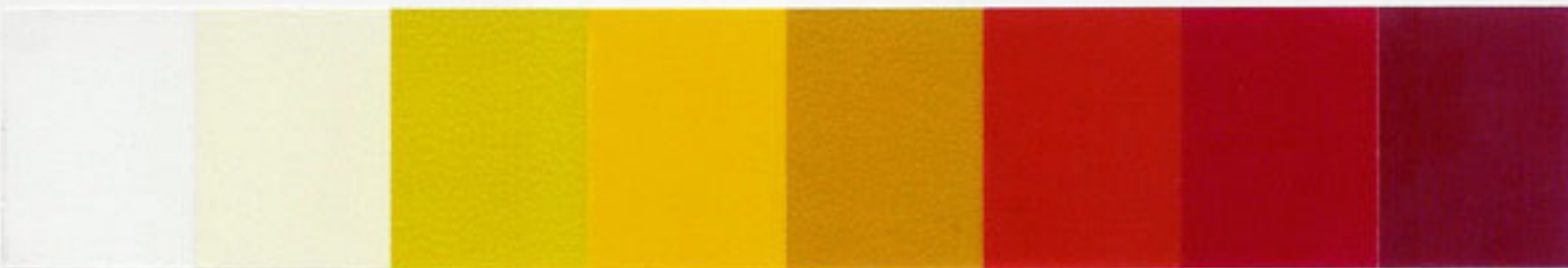
White Ivory Yellow Daffodil Gold Orange Red Dark Red