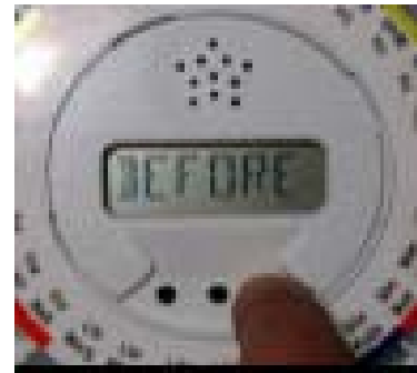
Figure 7: Before

Set Alarm Duration (AFTER) allows you to set alarms that continue to sound as further reminders after the actual alarm time.