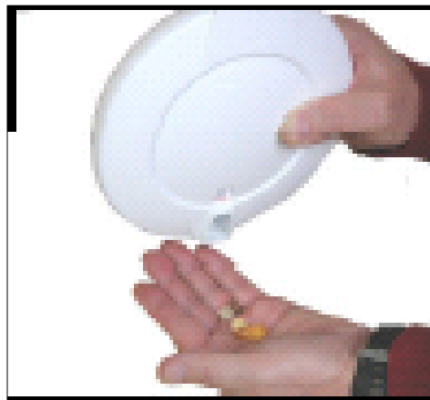
Figure 11: Early Dose