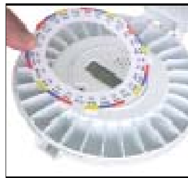
Figure 9: Indicator Ring

Prescription Card. Complete the Prescription Card and insert it under the automatic pill dispenser in slots provided over the battery cover for future reference.