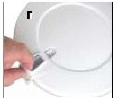
Figure 3: Open Unit