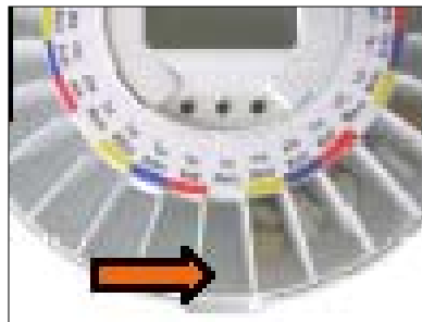
Figure 8: Load Dispenser

Indicator Ring. Three day/dosage discs are supplied with your e-pill Med-Time XL: