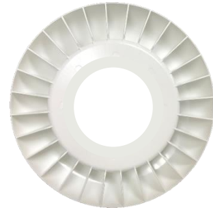
Medication Tray (x2) Item: 991020