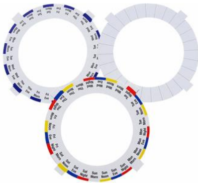
Dosage Template Set (x2) Item: 991018