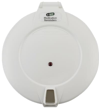
Locked Automatic Pill Dispenser (x1) Item: 991019