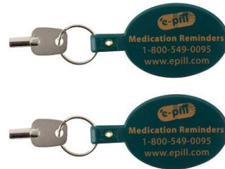
2 Keys Item: 991022