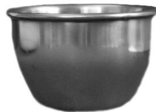
Stainless Steel Dose Cup Item: 992028