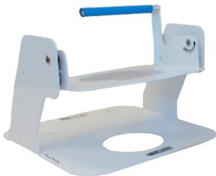
Station Item: 991024