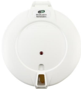
Locked Automatic Pill Dispenser Item: 991019