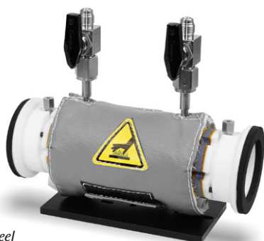
Heated Stainless Steel Short-Path Gas Cell