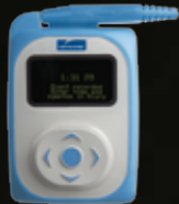
IQholter™, EX, EP