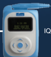
IQholter™, EX, EP