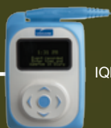
IQholter™, EX, EP