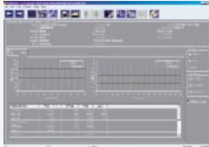
View session information