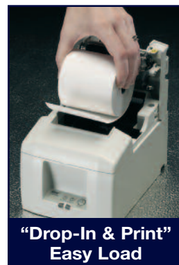
"Drop-In & Print" Easy Load