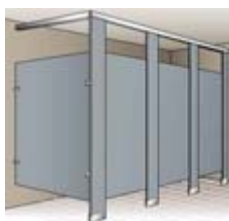
Head Rail Braced